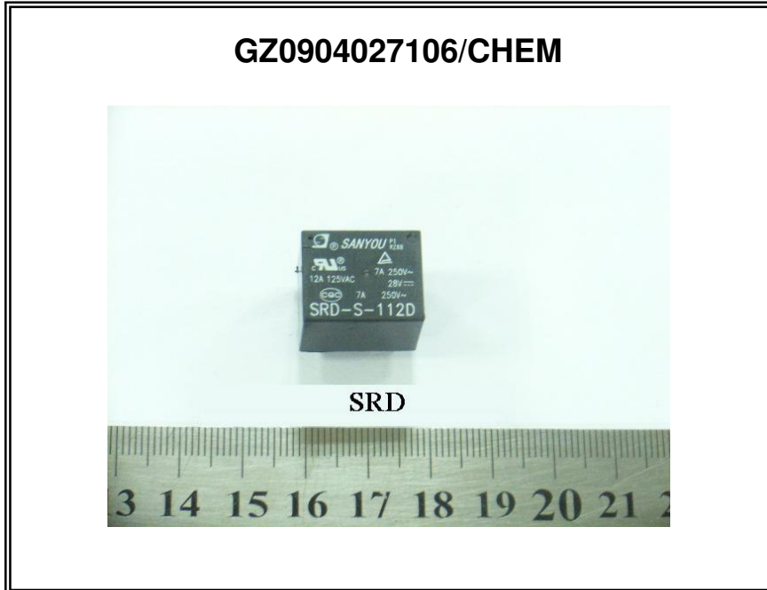
Photo for supplementary product